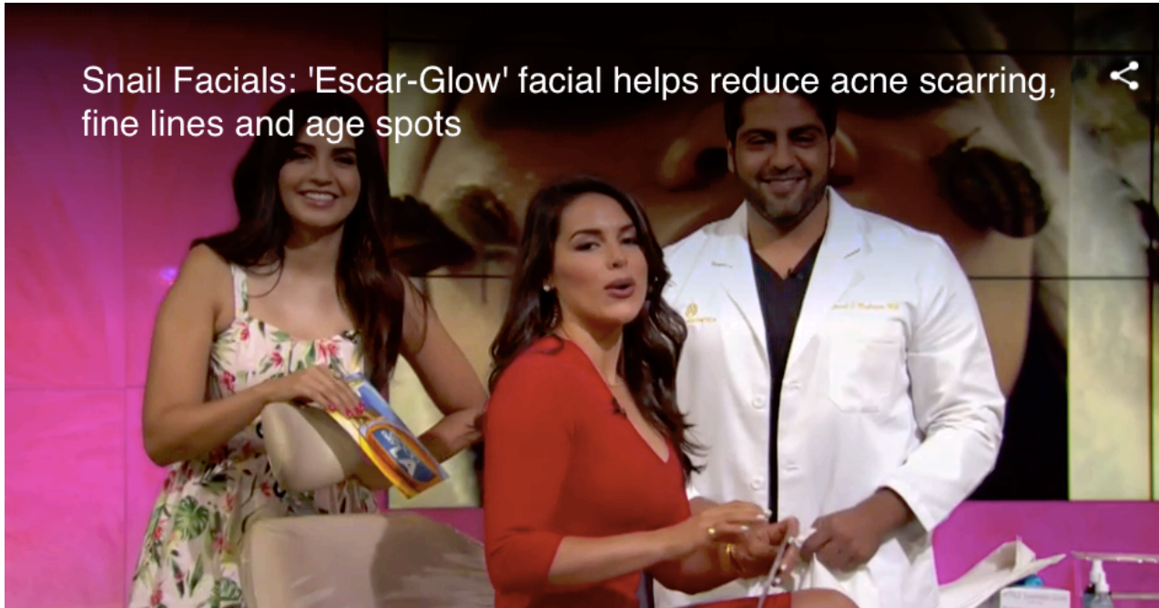
Snail Facials: 'Escar-Glow' facial helps reduce acne scarring, fine lines and age spots